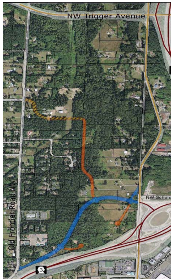
Figure 10.1 Connector Road Alignment

While allowed to be constructed at one time, it is likely that construction of these connector roads (funded by private development) would occur in two phases. Phase One (solid orange lines) would likely occur serving the commercial properties located nearest the Extension Road. This Phase would depend largely on the Extension Road for traffic circulation with no required connections to Old Frontier or Clear Creek Roads. Depending on the development patterns in the area, Phase Two (hatched orange line) would follow. This Phase is expected to be constructed at such time these urban residential and business center lands develop or traffic at the intersection with the Extension Road falls below approved levels of service. The location of Phase Two is flexible but must provide a free-flowing connection between Old Frontier Road and the northern end of Phase One that minimizes potential traffic conflicts. This flexibility will allow an alignment that maximizes development potential, is cost-efficient and protects the environmental and topographical features of the land.